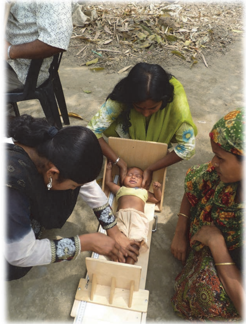
Nutritional status of women and children